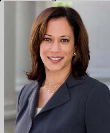
U.S. Sen. Kamala Harris

Similarly, the EPA grants California an annual waiver on regulating Greenhouse Gas (GHG) emissions. When questioned during a recent hearing in Washington, including by new U.S. Sen. Kamala Harris (D-CA), Pruitt would not issue a blanket endorsement of the waivers.