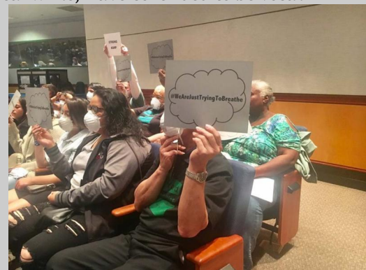
Photo posted on social media of attendees at a recent South Coast Air Quality Management District Board meeting.

Environmental activities, meanwhile, have continued to be vocal participants at every level of government and generally receive favorable treatment from elected officials unwilling to run afoul of anything labeled "green" regardless of what cost it imposes on business or unintended consequences to society.