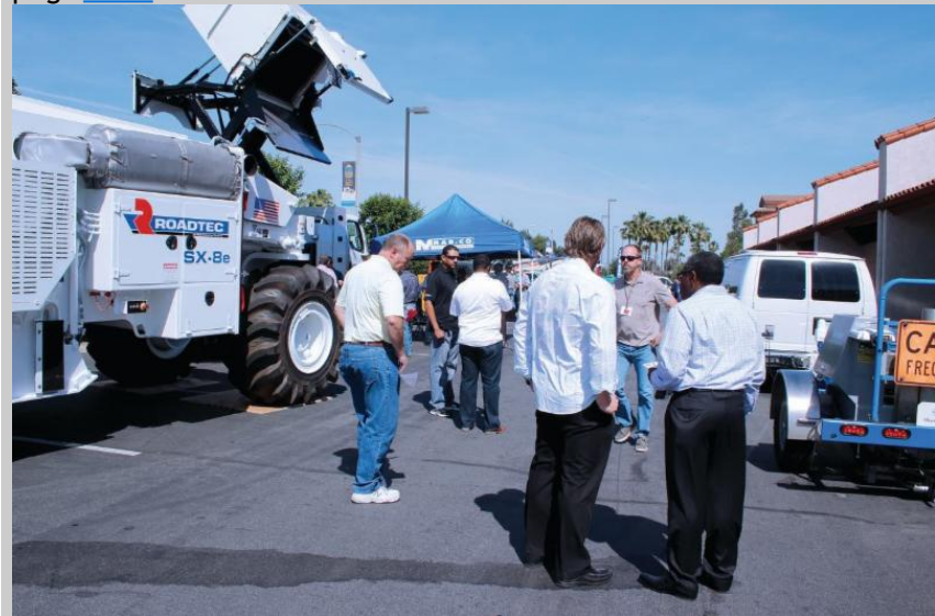
Lots of equipment will be on display at the Spring Asphalt Pavement Conference in Ontario.

For a list of exhibitors from last year's Spring Conference, click HERE . Photos from last year's Spring Conference are posted on our Facebook page HERE .